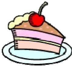
plate cherry cake