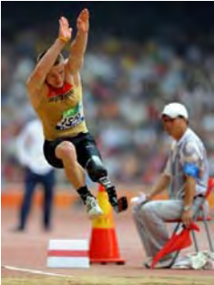
German Athlete Wojtek Czyz