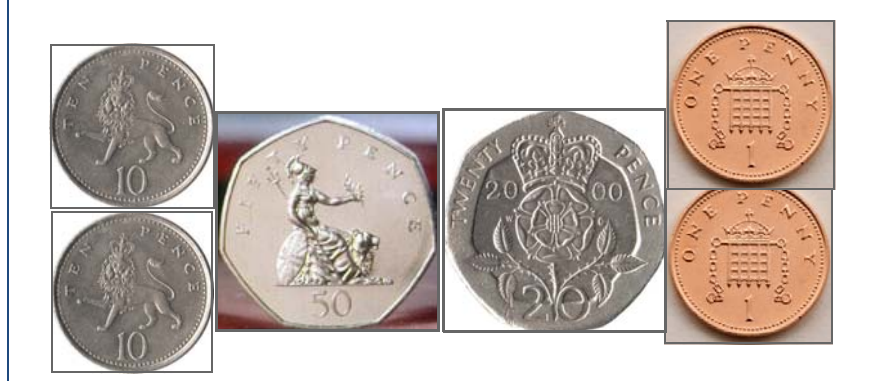
Who has 40p