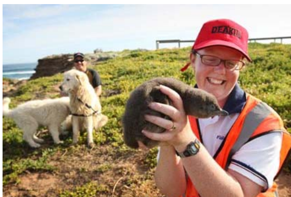
Scientists, with the Maremma dogs, checking the penguins and their chicks on Middle Island.

The local council was very happy and now use their own Maremma dogs to protect the penguins. Oddball has gone back home to care for the chickens. There are now over 80 adult penguins and 26 chicks.