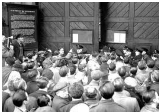
Wandsworth Prison at the execution of Derek Bentley in January 1953

Craig served 10 years before being released.