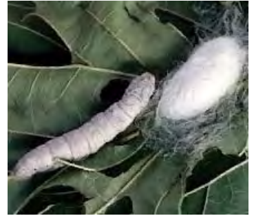
Silkworm and cocoon

Silk is made from the cocoon of the silkworm, which is not really a worm at all, but a silk moth caterpillar. The silkworm feeds on one thing only, the leaves of the mulberry tree. Once it hatches, it feeds on these leaves for about a month until it is ready to spin a cocoon around itself. Left inside, it would become a moth however it is harvested for silk production before this happens.