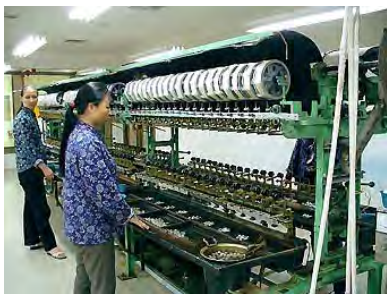
Silk being reeled.

The process is not so very different today although of course it has become mechanised. The cocoons are placed in a hot water bath and revolving brushes, or skilful hands, find the end of the filament. A number of filaments are drawn up from